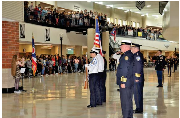
Military service men and women, police officers and fire fighters were present for Westerville Central's annual September 11 remembrance ceremony, which took place at the exact time the first World Trade Center tower was struck in New York City.

and countless clubs and experiences for students beyond the classroom. Monetary support provided by member groups collectively totaled $1,128,436.17. WPC's member groups also supported graduating seniors from all three high schools with scholarships totaling $52,750.