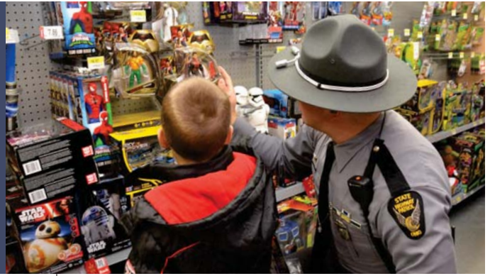
In December 2016, law enforcement officials purchased holiday gifts at Walmart in Westerville for underprivileged schoolchildren through a program called "Shop with a Cop."

The Westerville Way is an effort to support and nurture the shared virtues of our community. Adults are encouraged to model and reinforce ethical behavior in relation to the following 12 monthly words: respect, citizenship, tolerance, caring, attitude, honesty, perseverance, trustworthiness, responsibility, integrity, loyalty and fairness. Students in every Westerville school participated in projects benefiting the environment, the underprivileged, and those stricken with illness.