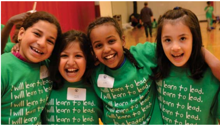
More than 145 third, fourth and fifth grade students participated in the 11th annual Elementary Leadership Summit.