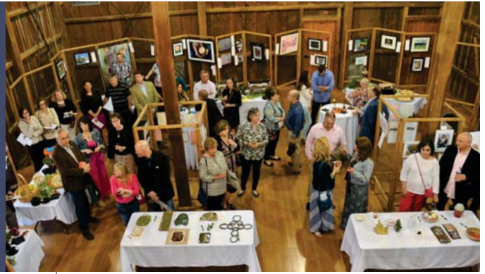
Original pieces were auctioned at “An Artful Affair,” hosted by the Westerville Education Foundation, Concord Counseling and the Arts Council of Westerville. Presenting sponsor was Alliance Data and supporting sponsor was Nationwide Children’s Hospital.

A goal of the Westerville City Schools Board of Education is for the community, parents, students and staff to work together to benefit children and their families. The district’s relationship with the Westerville Medical Campus of OhioHealth is a stunning example of an exemplary partnership.