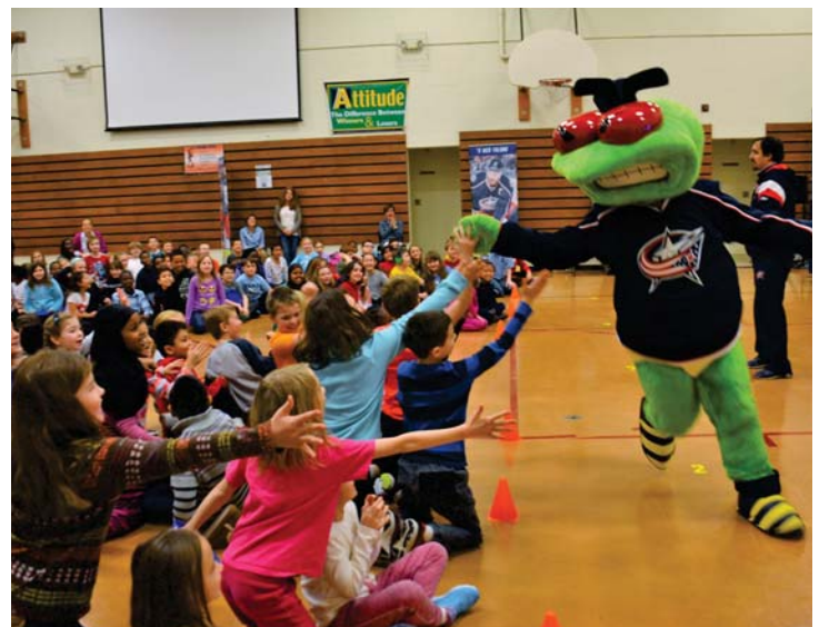
Stinger, mascot for the Columbus Blue Jackets, visited students at Robert Frost Elementary School. He encouraged them to participate in at least 60 minutes of active play each day.