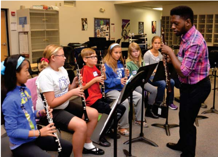
At Blendon Middle School, a Workshop for Winds was held, featuring teachers from Otterbein and Ohio State Universities