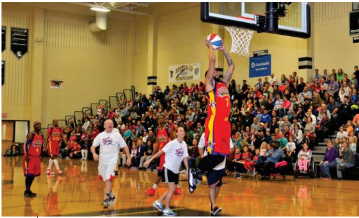
The Wonders of Westerville competed admirably against the Harlem Wizards in a game that featured crowd-pleasing antics. Proceeds from the event benefitted the Libraries for Liberia Foundation and the Westerville City Schools' English as a Second Language Department.